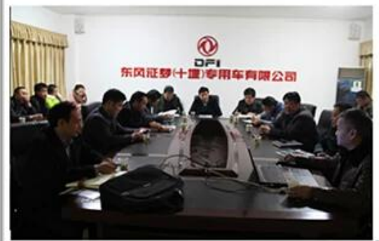
Why choose us